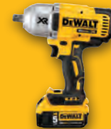
DCF899 1/2" 20V MAX** High Torque Impact Wrench