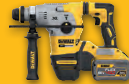
DCH293 1-1/8" 20V MAX** SDS Plus Rotary Hammer